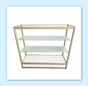
低玻璃陈列柜 (1200Lx400Wx1100Hmm) 200元 押金 200元/个