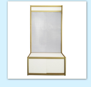
匙孔板展示柜 (1000Lx400Wx2200Hmm) 180元 押金 100元/个