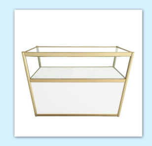
低玻璃柜(金)(1200Lx400Wx800Hmm) 200元 押金 200元/个