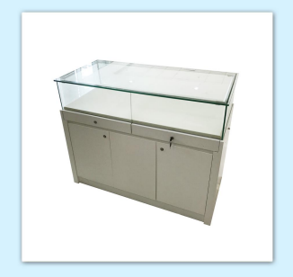
烤漆柜(1250Lx600Wx1000Hmm) 600元 (1200Lx600Wx1000Hmm) 600元