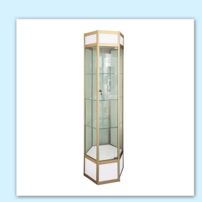
六角玻璃展示柜 (530Lx530Wx2000Hmm) 260元