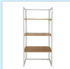
货架展示柜(1000Lx350Wx1800Hmm) 180元 押金 100元/个