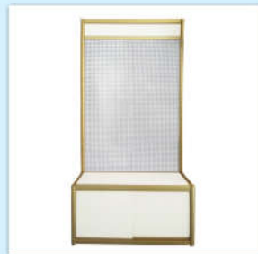
匙孔板展示柜 (1000Lx400Wx2200Hmm) 180元 押金 100元/个