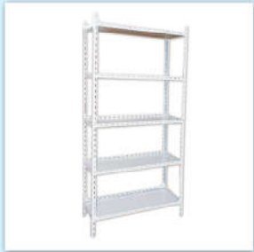
货架(1000Lx350Wx2050Hmm) 180元 (1500Lx350Wx2050Hmm) 240元