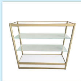
低玻璃陈列柜 (1200Lx400Wx1100Hmm) 200元 押金 200元/个