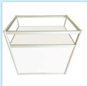
低玻璃柜(1000Lx600Wx1000Hmm) 200元 押金 200元/个