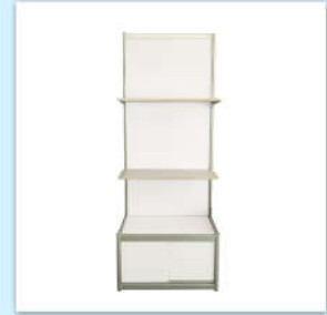
隔板展示柜(800Lx400Wx2200Hmm) 150元 押金 100元/个