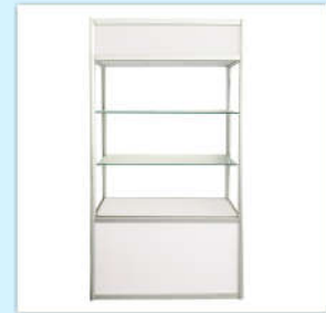
高玻璃柜(1000Lx350Wx2000Hmm) 400元 押金 200元/个