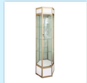
六角玻璃展示柜 (530Lx530Wx2000Hmm) 260元 押金 200元/个