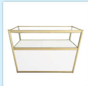
低玻璃柜(金)(1200Lx400Wx800Hmm) 200元 押金 200元/个