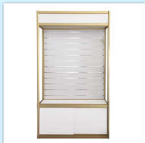
槽板展示柜(1200Lx300Wx2200Hmm) 400元 押金 200元/个